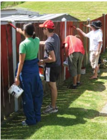
The Shell employees involved in Poirua

Your support will allow hundreds of families to benefit from our 'A Brush With Kindness' programme and receive a 'hand-up'.