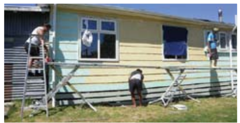
A house in Kawhia receiving new coat of paint