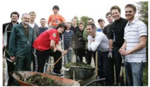
The street church making a difference