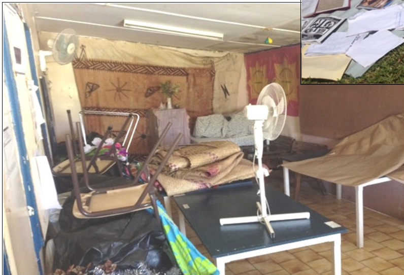
The ceiling here fell so the Matron's Office computer got wet and was destroyed. They just nailed back the board.