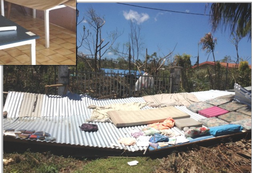
This is the iron roof blown away and deposited just at the front of the Project house. In late March, matron and the girls used it as a dryer. It has now been lifted back into place, but it is not particularly secure.