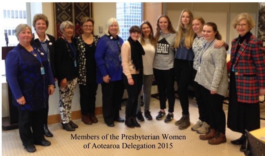
Members of the Presbyterian Women of Aotearoa Delegation 2015