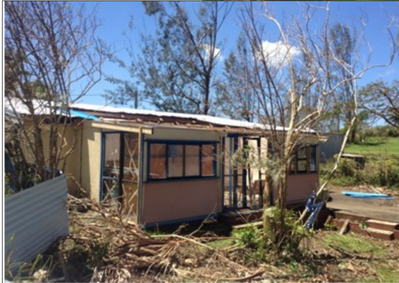
The wind broke one side of the glass door at the side of the house and lifted the roof.