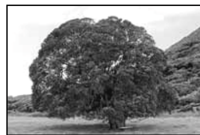
Pohutukawa tree – N.Z. Christmas tree