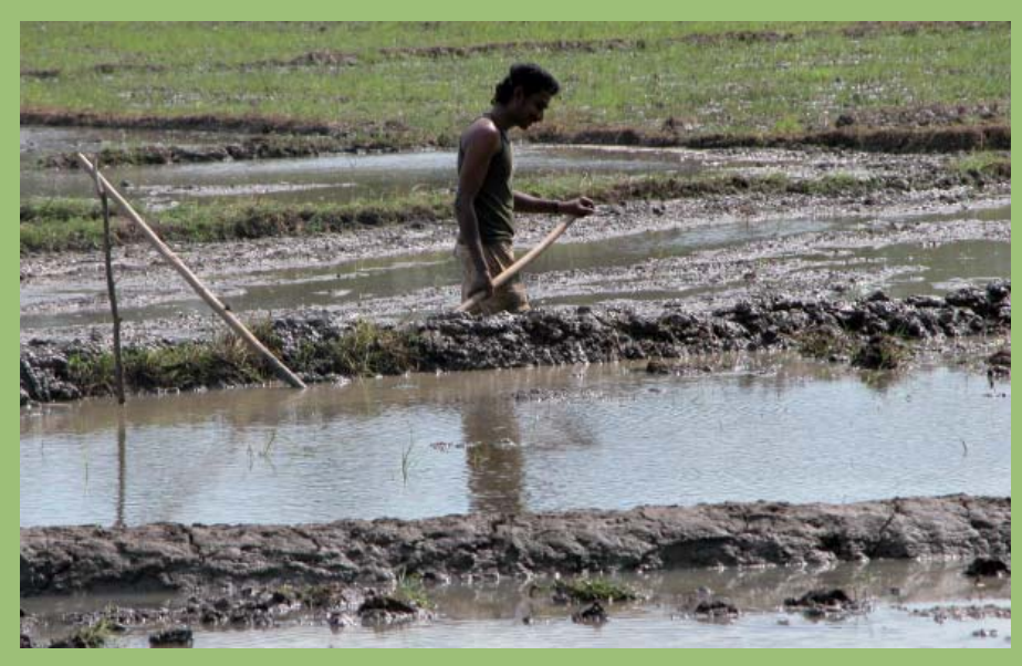
Irrigation scheme for rice paddies in the Walawe River, Sri Lanka

Monlar is working to reverse this situation by advocating for a return to more small-scale paddy production, traditional methods, and a return to planting indigenous seed. This vision encourages communities to work together and to explore methods of agriculture that are less labour and water intensive.